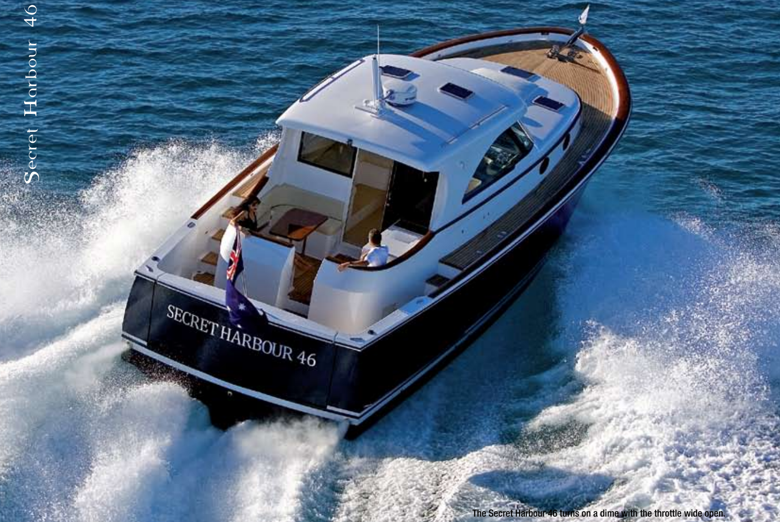
The Secret Harbour 46 turns on a dime with the throttle wide open.

Whether it's found battling the ferocity of a merciless storm in fierce swell, or resting in the tranquil beauty of a sheltered coastal refuge, the sea in all its many guises has been a constant source of inspiration for men and women down through the ages.