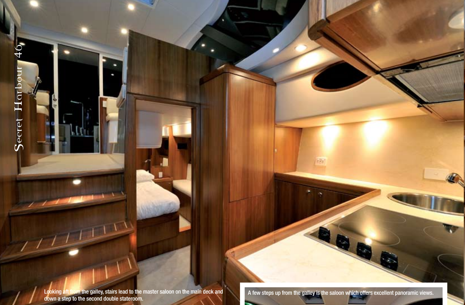
Looking aft from the galley, stairs lead to the master saloon on the main deck and down a step to the second double stateroom.

“Very few yachts of this size offer so much accommodation and if they do, they are not nearly as generous or as accessible.”