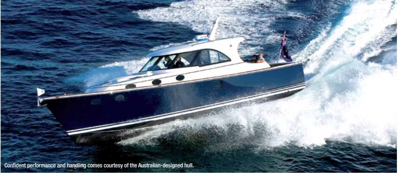
Confident performance and handling comes courtesy of the Australian-designed hull.

side of the Muir anchor windlass and lockers in the alfresco area aft. The alfresco area can be built as shown or the barbeque, sink and fridge can be housed in the aft bulkhead accessible from the fishing deck, allowing for more seating and outdoor dining for up to 10 people.