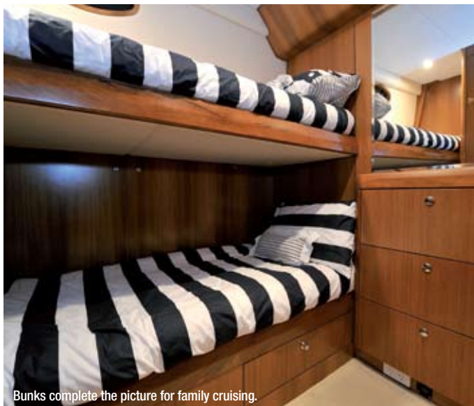
Bunks complete the picture for family cruising.

“In its short time on the water, tests with a number of experienced boat owners, unsolicited comments have included: ‘this yacht is in a league of it’s own’ and ‘it’s the best riding yacht of its size amongst the other main production boats available on the Australasian market today.’”