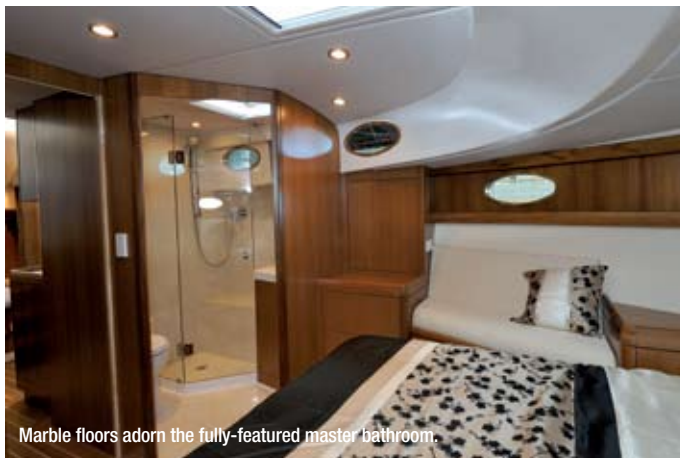
Marble floors adorn the fully-featured master bathroom.