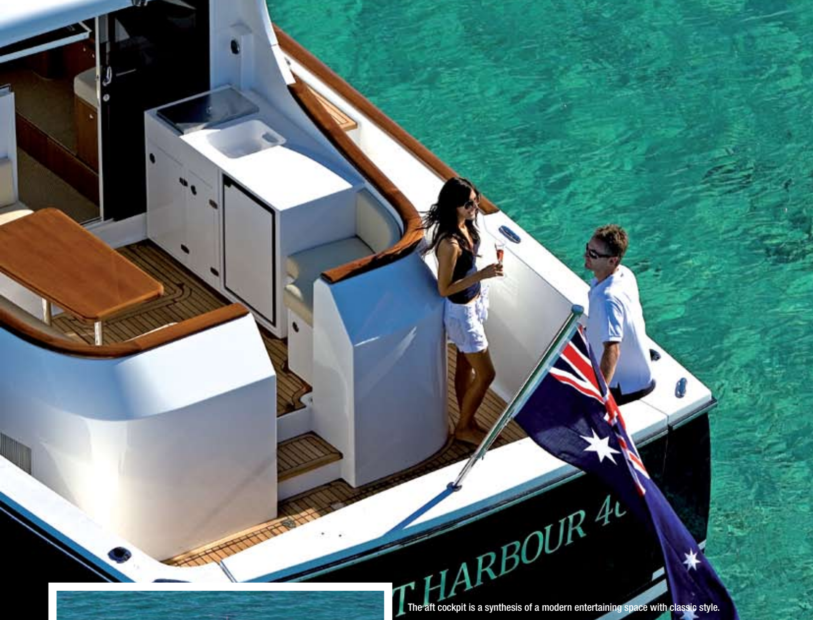
The aft cockpit is a synthesis of a modern entertaining space with classic style.

“The fishing deck has a unique drop-down transom which makes diving, fishing and swimming far easier and the water more accessible. A boarding ladder can be fitted to the hull right beside the transom or a foldaway ladder can be fitted to the transom itself.”