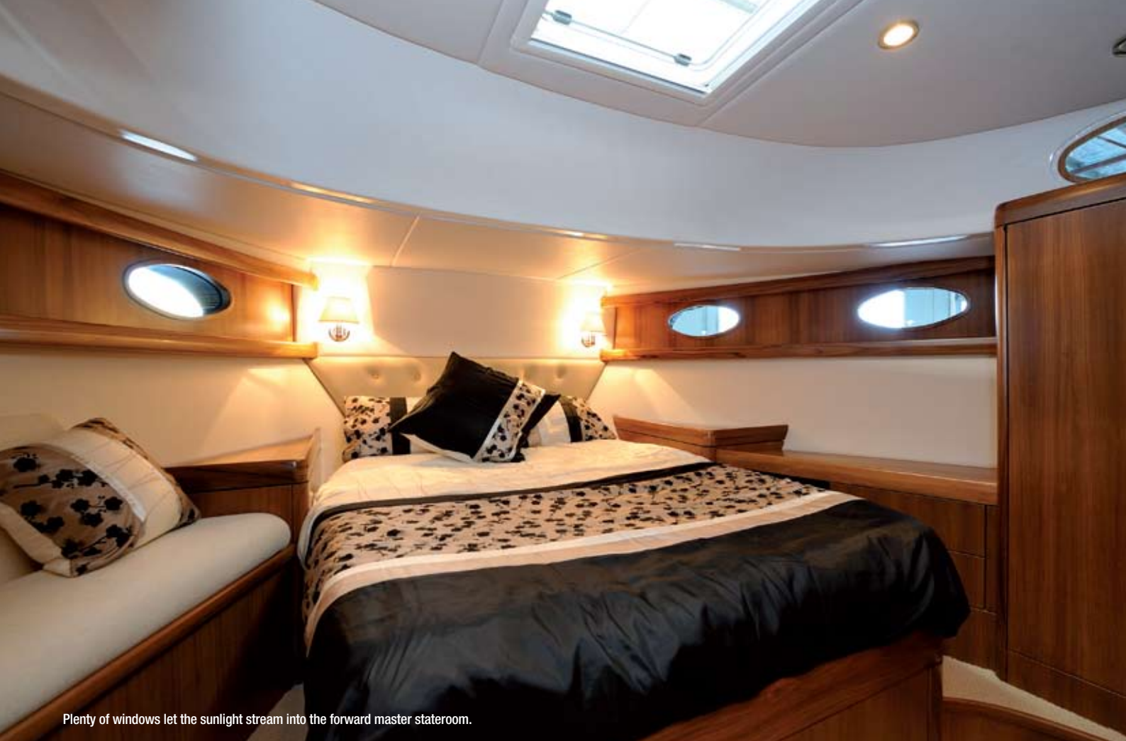
Plenty of windows let the sunlight stream into the forward master stateroom.