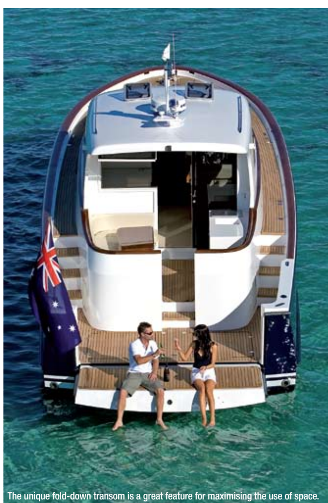
The unique fold-down transom is a great feature for maximising the use of space.

It has joystick operation which is both simple to use and